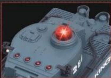
电源指示灯 POWER INDICATOR