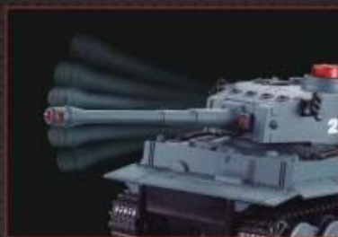
炮管上下移动 THE GUN BARREL MOVES UP & DOWN