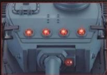
生命力指示灯 VITAL FORCE INDICATOR