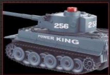
仿真履带，超强爬坡能力 SIMULATED PEDRAIL, STRONG CRAWLER