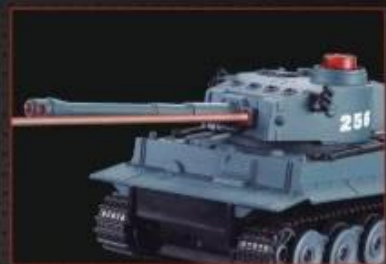
红外线搜索装置 INFRARED SYSTEM