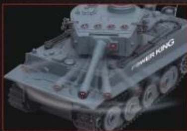
炮塔300° 旋转 EMPLACEMENT CAN TURN 300°