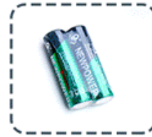
transmitter battery*1 instruction Manual*1