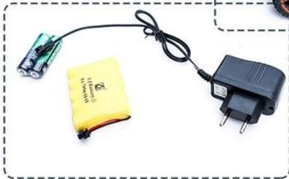
charger*1, battery*1 transmitter battery*1 instruction Manual*1