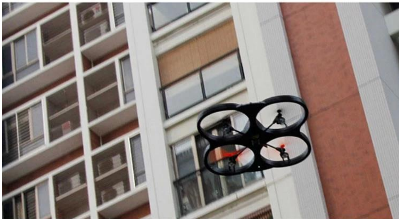
Models in size, appearance, temperament, and cultural foundation, professional feel, display capabilities, and so has certain conditions and have a good fashion design, production and fabrics, accessories and make stage lighting has a certain ability to comprehend, this group of work in the T-stage worker. Generally tall.