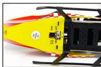
THE BOTTOM OF THE PLANE