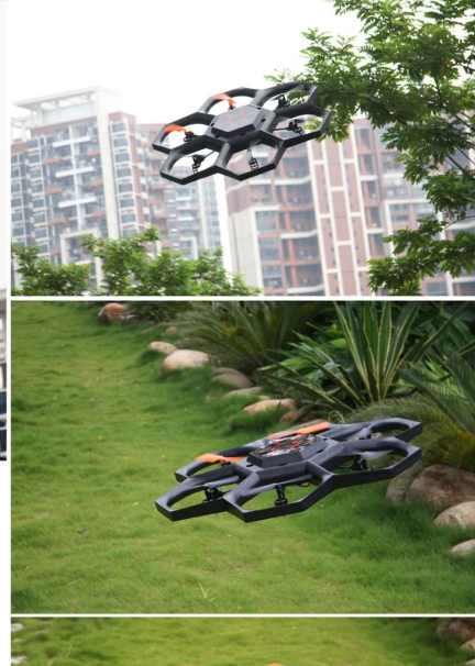
High quality PVC 30 meters high crash, not damaged