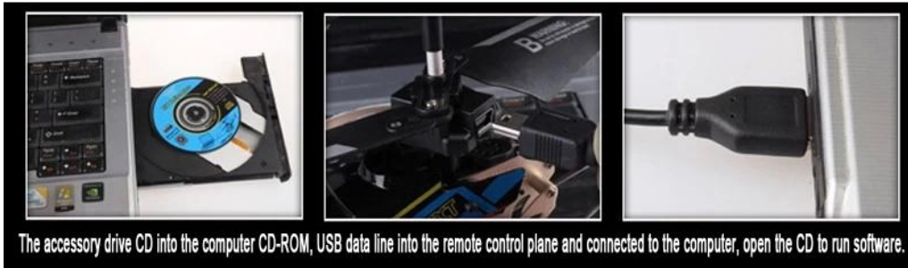
The accessory drive CD into the computer CD-ROM, USB data line into the remote control plane and connected to the computer, open the CD to run software.