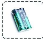
transmitter battery*1 instruction Manual*1