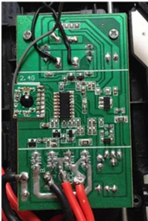
2.4Ghz Remote Control