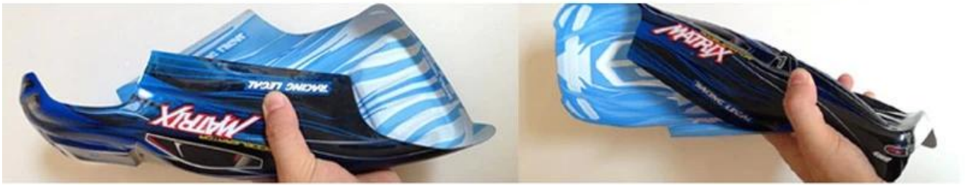
PVC material car shell