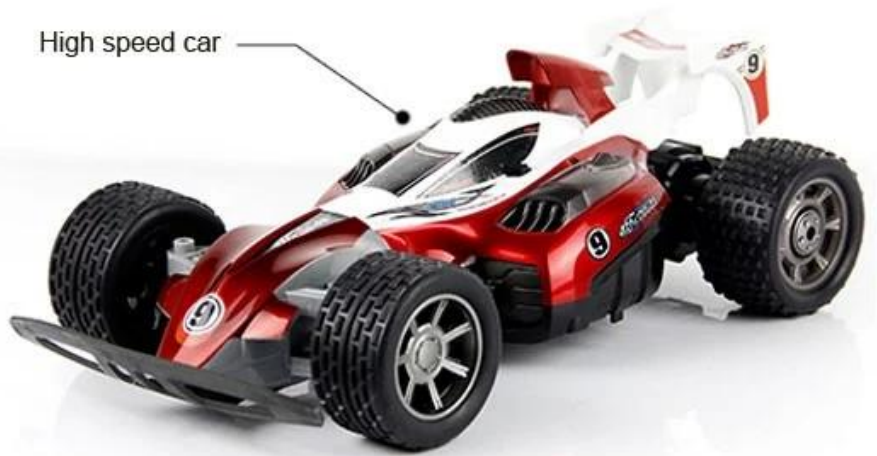
High speed car