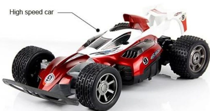
High speed car