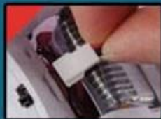
2. Connect the power supply