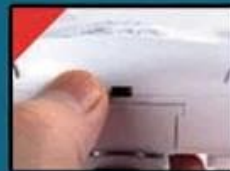
3. Open switch