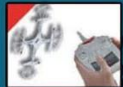
4. press the ON/OFF power switch up