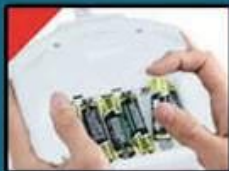
1. Installing the Battery