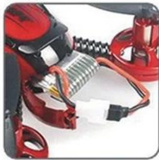
3.7V 380mAh LI-PO