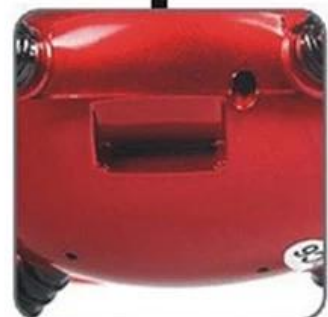
2 GB MEMORY CARD