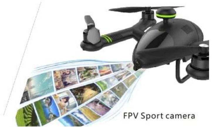
FPV Sport camera