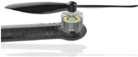
Well-Functioning heat dissipation system