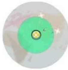
Fail - Safe

Fail-safe Improve safe coefficient In condition of weak remote signal, aircraft will hover in situ for 3 seconds, and return to the origin.